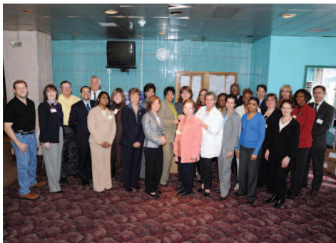
HRD representatives at the GWB last month.

The event was well received, with more than 200 attendees.