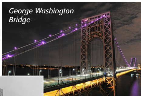
George Washington Bridge