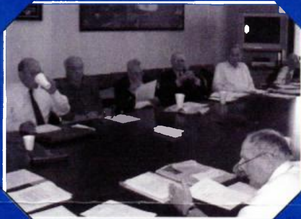
Pictured: The September 22, 2004 PARA Board of Directors meeting underway at the Port Authority Offices.