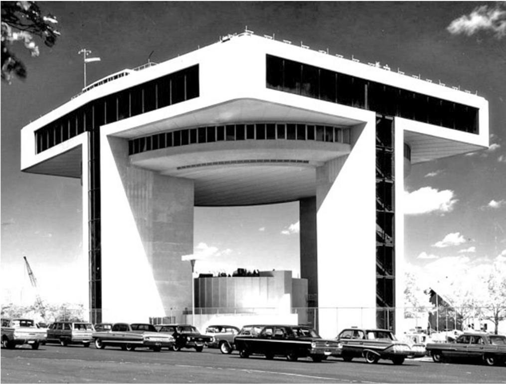
The 120-foot PA Heliport and Exhibit Building at the Fair, designed by PA staff, housed a heliport, restaurant, cocktail lounge and, at ground level, a circular theater.

It's hard to believe that 50 years have passed since the opening of the 1964-65 New York World's Fair in Flushing Meadows Park. For many, the important role of the PA in the Fair is likely just a faded memory.