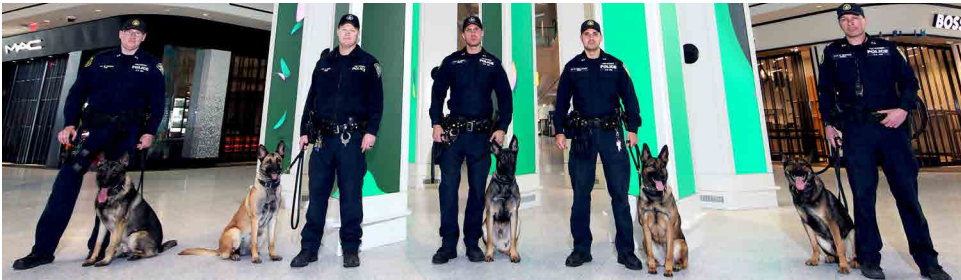
The PAPD's newest K-9s with their partners