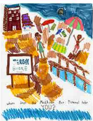
Hayley Hirshon Grade 3 PS303Q – Forest Hills, NY