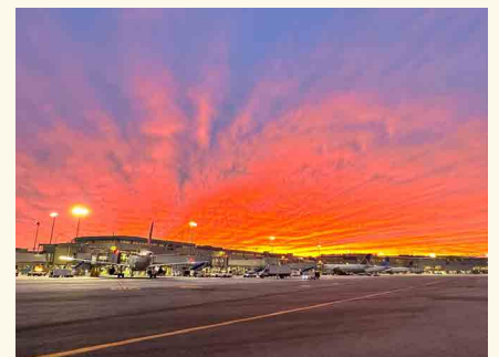
Sunset over the tarmac at EWR