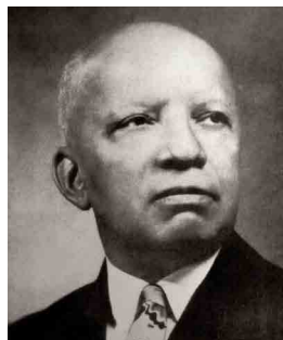
Dr. Carter G. Woodson, father of Black History Month