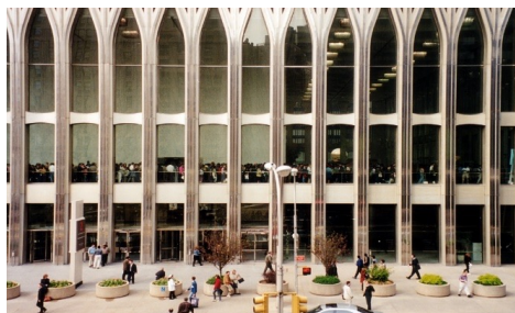
Heavy concrete planters around the WTC after 1993 are the precursors to the sidewalk bollards that are now commonplace throughout New York

Those security measures, emergency systems, and improvements to fire codes for buildings in New York City, among others, are the legacy of the day 30 years ago this Sunday when six people, including four Port Authority employees, and an unborn child died in a terrorist attack at the World Trade Center.