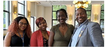
NBE members hosted colleagues from across the agency for a Juneteenth celebration