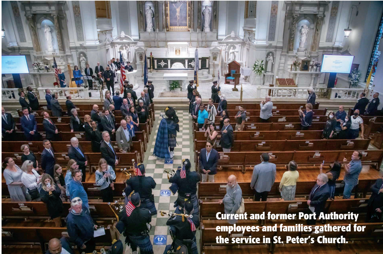
Current and former Port Authority employees and families gathered for the service in St. Peter's Church.

The Port Authority family gathered as always on September 11th at St. Peter's Church on Barclay Street for an Interfaith Remembrance Service to mark the anniversary of the 9/11 attacks on the World Trade Center. The agency also held a rose-laying service a few days earlier at the WTC Memorial pools, continuing an on-site remembrance introduced among the events marking the 20th anniversary of the attacks last year.