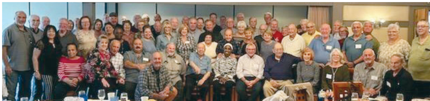
SCJR 15th Anniversary Luncheon – October 13, 2022