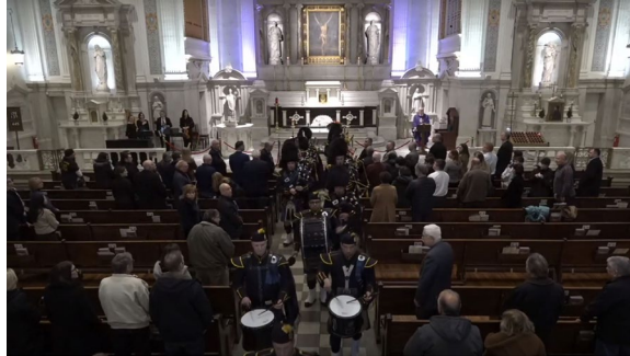
The PA family gathered at St. Peter's for its annual remembrance service

On the afternoon of Sunday, February 26, friends and family of those lost in the 1993 World Trade Center bombing gathered together in remembrance. And as is tradition, the Port Authority hosted a Memorial Mass at St. Peter's Roman Catholic Church to honor the faith shared by our fallen friends and colleagues.