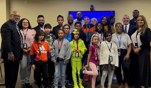
Office of Diversity, Equity and Inclusion