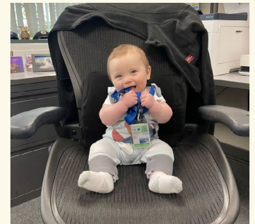
JFK International Airport