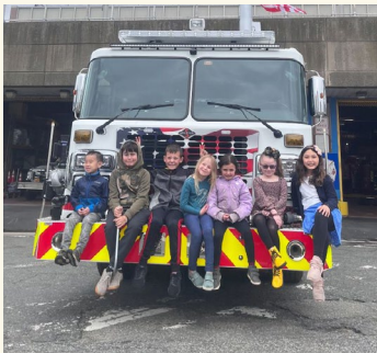
George Washington Bridge

Departments came up with all sorts of fun and engaging activities to show these PA children all about what we do each and every day. From scavenger hunts, arts and crafts, budgeting games, meet and greets with PAPD officers and K-9s, live demonstrations, and guided tours, there was plenty of fun and interactive learning to be had by all.