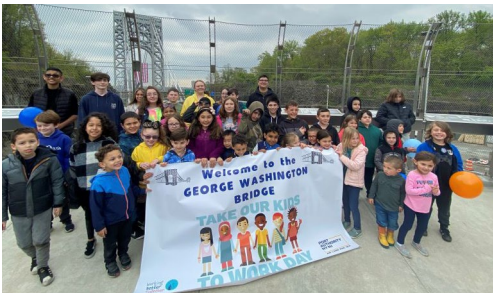
George Washington Bridge