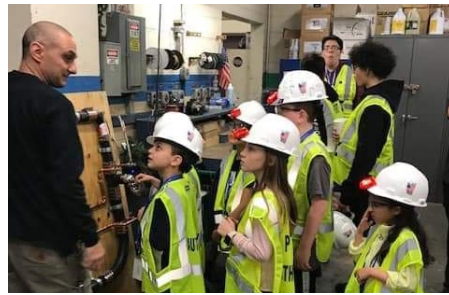
Midtown Bus Terminal