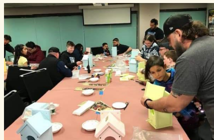
Midtown Bus Terminal