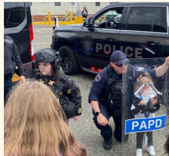
JFK International Airport