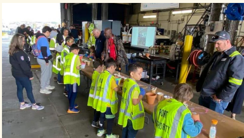
Newark Liberty International Airport