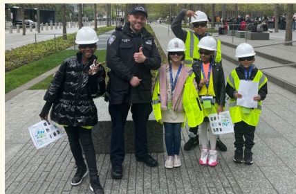
Major Capital Projects