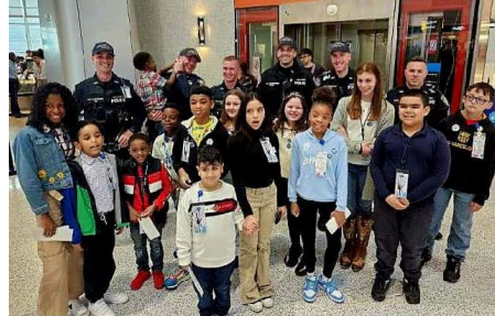
Newark Liberty International Airport