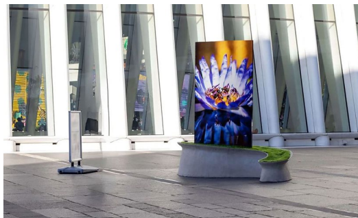
The Pollinate display last year at the WTC Oculus