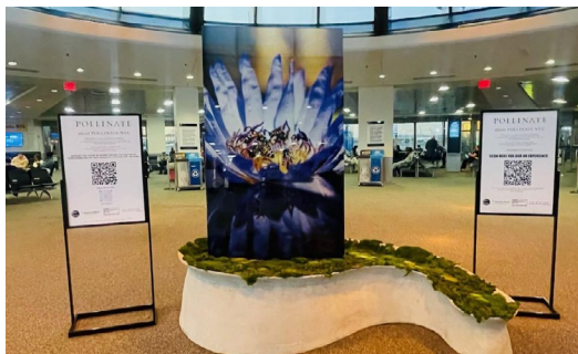
The Pollinate display at EWR Terminal B

Be sure to check it out the next time you're traveling through EWR Terminal B. The exhibit will be on display through October.