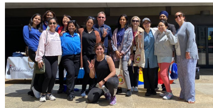
Employees marked AAPI Heritage Month with a Bollywood dance workshop on May 26