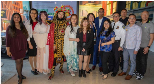
PA-AAA leadership, members, and guest performers