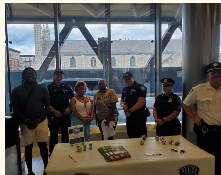
GWB Bus Station