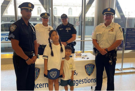
GWB Bus Station