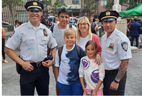
Midtown Bus Terminal

Each year, the Port Authority Police Department along with police departments across the country take part in 'National Night Out,' an annual community-building campaign that forges relationships and fosters a stronger sense of community in the neighborhoods that we serve.