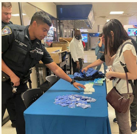
PATH Journal Square

On the first Tuesday of every August, tens of thousands of police departments across the country join together with their neighbors and community members to promote neighborhood camaraderie, enhancing the relationship between neighbors and law enforcement while bringing back a true sense of community.