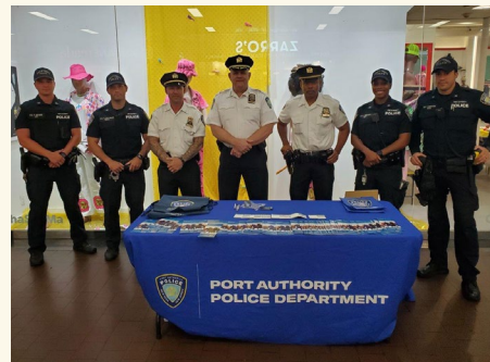
Midtown Bus Terminal