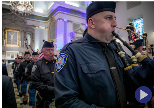
PAPD Pipes & Drums performing during the service

The annual Port Authority 9/11 Interfaith Service was an opportunity to remember fallen colleagues and pay tribute not only to their memory, but to the courage and selflessness they showed that day. Agency leadership, employees, retirees, clergy, and elected officials all joined together to honor the memory of those lost on September