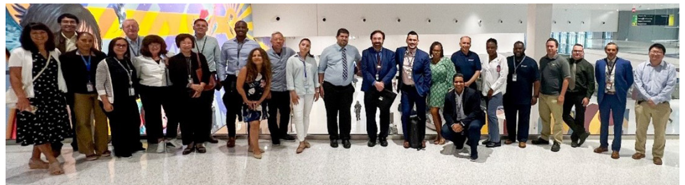
Members of the TCAP community