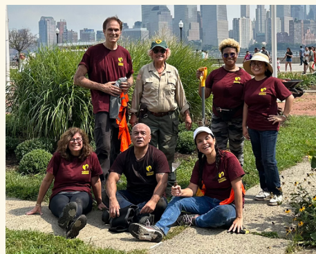
Liberty State Park