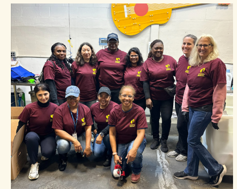
Long Island Cares