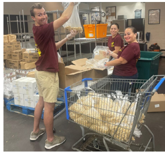
St. John's Bread and Life