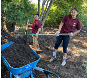
NJ Tree Foundation

The Remembrance Through Renewal team sends a heartfelt 'thank you' to all who participated in the 2023 Month of Service. Thanks to your help, we were able to partner with 26 organizations across the bi-state region. Over 200 participants representing departments throughout the agency came together to organize food bank donations, get their hands dirty with some landscaping work, scrub subways and boats, and much more! In addition, more than