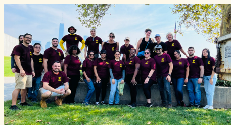
Liberty State Park