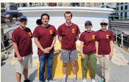
South Street Seaport