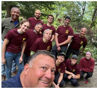
Bruce Reynolds Garden