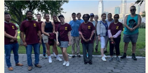
Battery Park City