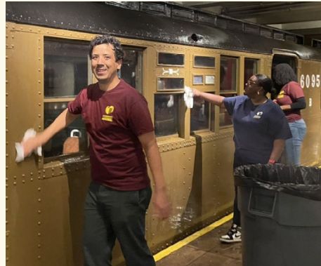
NY Transit Museum