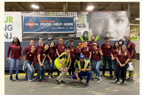
Community Food Bank of NJ