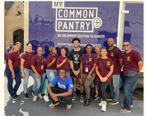
NY Common Pantry – Harlem