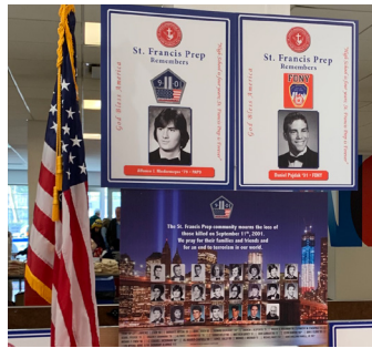
Posters hang honoring the 15 St. Francis Prep alumni who perished on 9/11