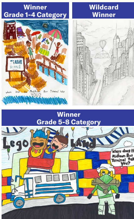
The colorful winning submissions from the 2022 poster contest.

For more information on the poster contest, including prize details, terms and conditions, and how to enter, visit the 2024 PABTAC poster contest website .