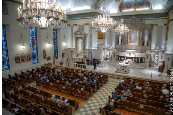
The PA family gathered at St. Peter's for its annual remembrance service

Honoring and acknowledging the legacy of Port Authority employees is part of the agency's fabric. We come together as family both in good times and challenging times. As we have done for more than three decades, the PA family came together to remember those colleagues we lost in the February 26, 1993, bombing of the World Trade Center, in a Memorial Mass at St. Peter's Roman Catholic Church, which honors their shared faith.