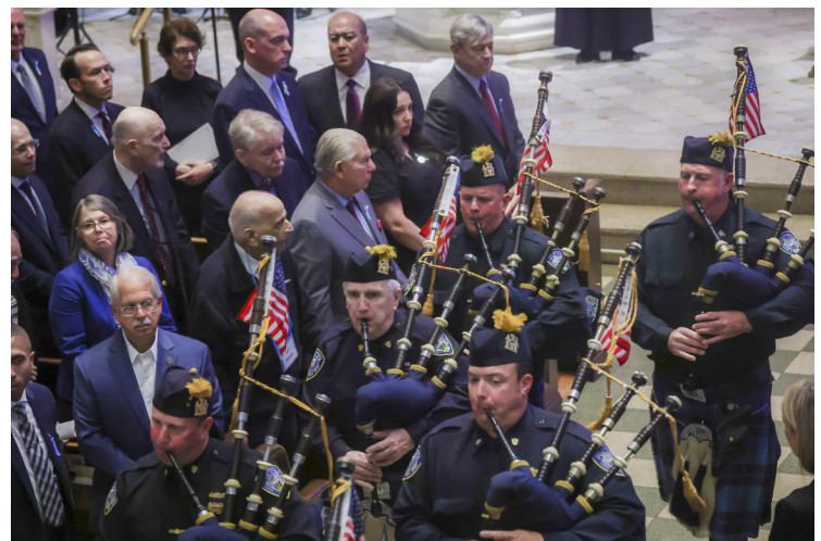
PANYNJ leadership, joined by employees and retirees, attended the solemn yearly September 11th service at St. Peter's Church in Lower Manhattan.