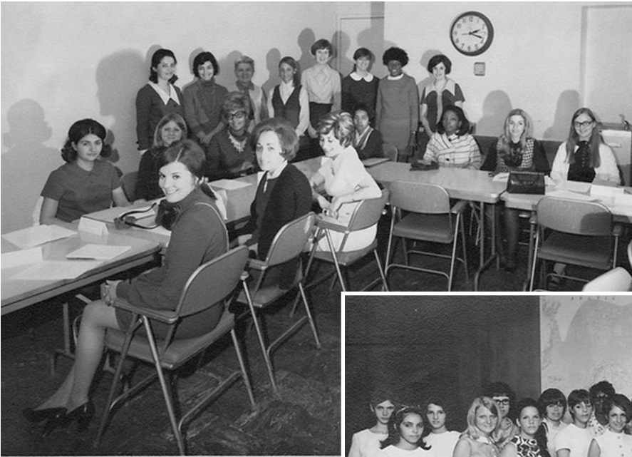
ABOVE: Advanced Secretarial Training Class February 1970.