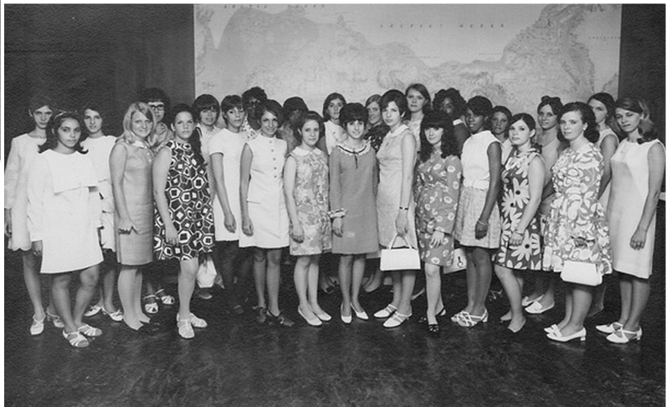
RIGHT: A Basic Clerical Training Program July 1968

If you would like to receive PA News sent to your personal email, send a note to panews@panynj.gov