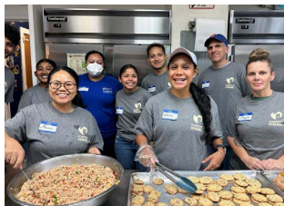
Hoboken Homeless Shelter