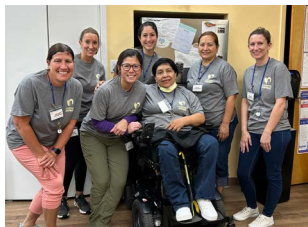
Interfaith Nutrition Network