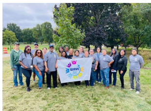
Queens Botanical Garden