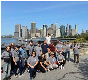
Brooklyn Bridge Park

A special thanks to the agency's Employee Business Resource Groups (EBRGs) and their dedicated memberships for hosting several events! We thank you all for your participation. It is truly a special way give back to the community in honor of the friends and colleagues lost in the attacks on the World Trade Center on February 26, 1993, and September 11, 2001.