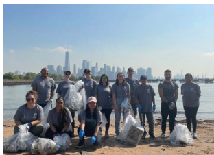
Liberty State Park