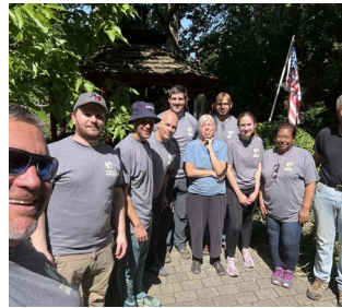
Bruce Reynolds Garden