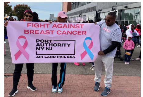
NBE members at a prior year's walk.

In addition to Newark, there will also be walks all across the bistate region. You can find your local walk on the ACS Making Strides website .